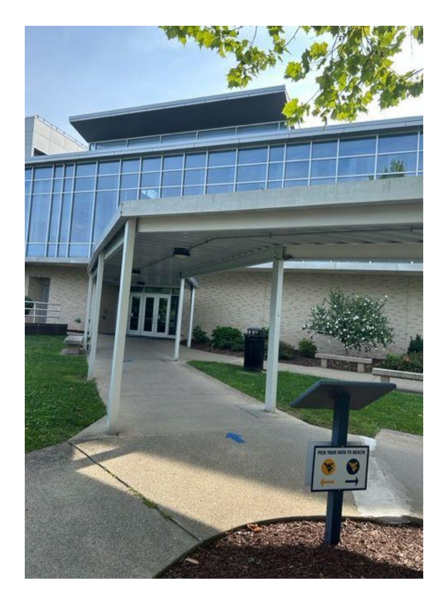
Pictured here is <u>HSC North PRT Walkway Entrance</u> (front view left; side view from parking lot right). If entering here, go through two sets of double doors and to the right once inside down Pylons/Room 1900s hallway.